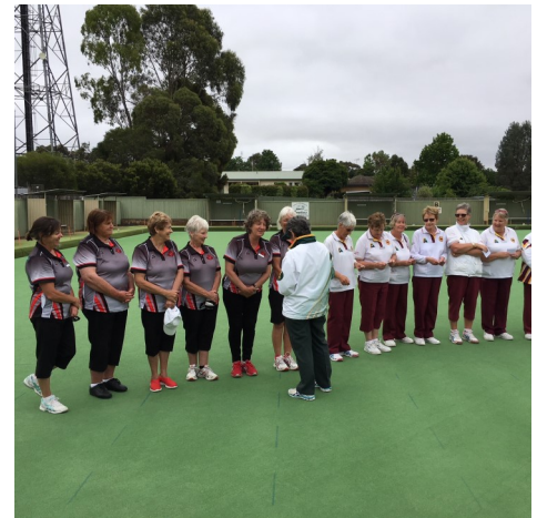
Presentation of Badges